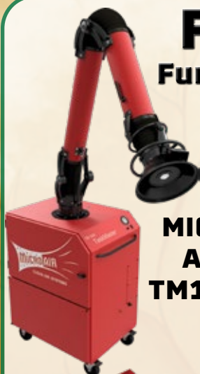
MICRO AIR TM1000

As cooler weather sets in and shop ventilation tightens, MicroAir's TM1000 portable air filtration unit delivers powerful, on-the-spot fume and dust capture. Its compact design, self-cleaning filters, and easy mobility make it the ideal solution for welding and metalworking environments where clean air is a must.