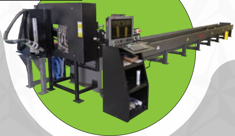
REVOLVER CNC Pipe Cutting