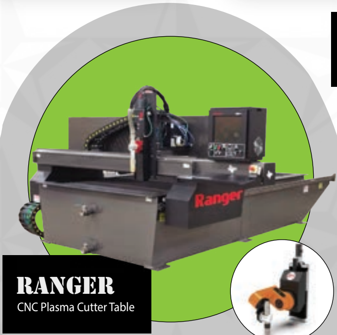
RANGER CNC Plasma Cutter Table