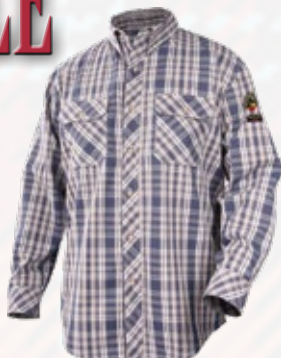
AR/FR Cotton Work Shirt (7oz.)