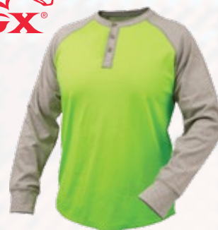
Flame Resistant Cotton Jersey Henley (7oz.)