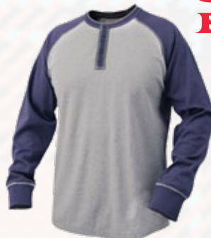
Flame Resistant Cotton Jersey Henley (7oz.)