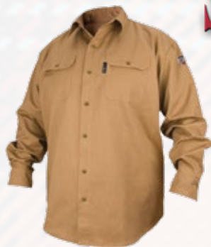
Flame Resistant Cotton Work Shirt (7oz.)