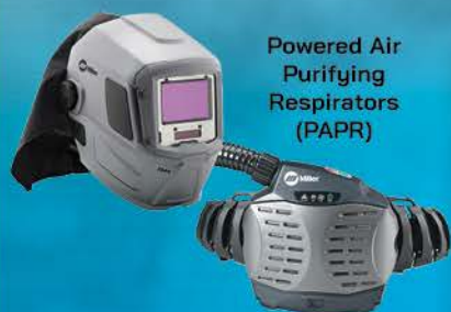
Powered Air Purifying Respirators (PAPR)

Schedule a visit with a Factory Expert today! Meet with a Lincoln or Miller Rep to review your needs and receive a set of thermal tumblers.