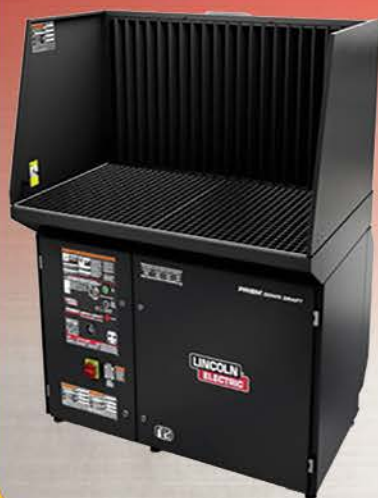
Downdraft Tables By Lincoln