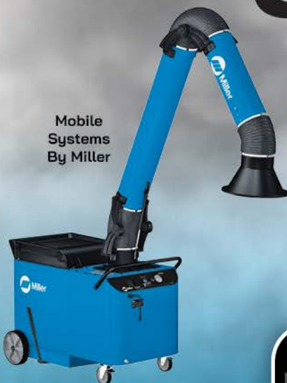
Mobile Systems By Miller