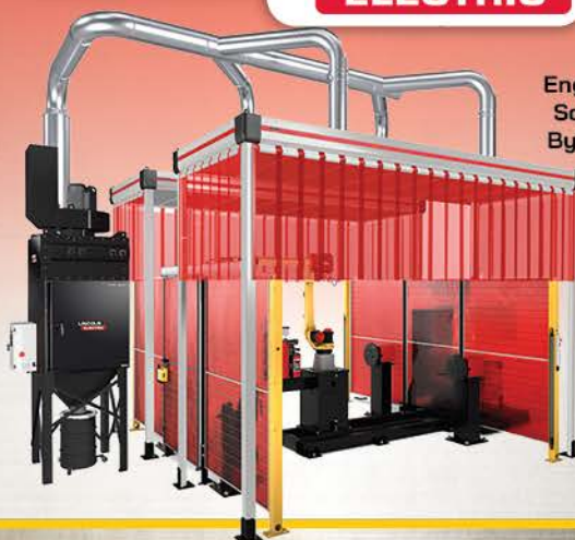
Engineered Solutions By Lincoln