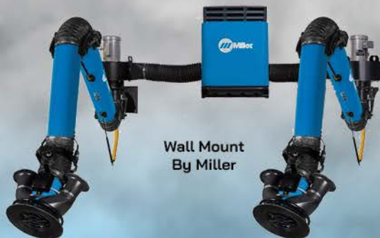
Wall Mount By Miller