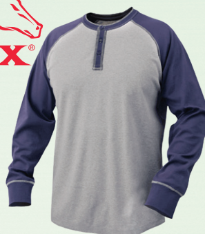
Flame Resistant Cotton Jersey Henley (7oz.)