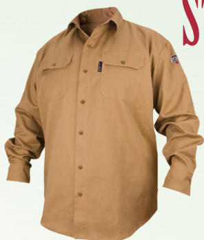
Flame Resistant Cotton Work Shirt (7oz.)