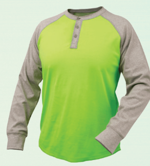
Flame Resistant Cotton Jersey Henley (7oz.)