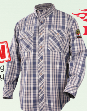
AR/FR Cotton Work Shirt (7oz.)